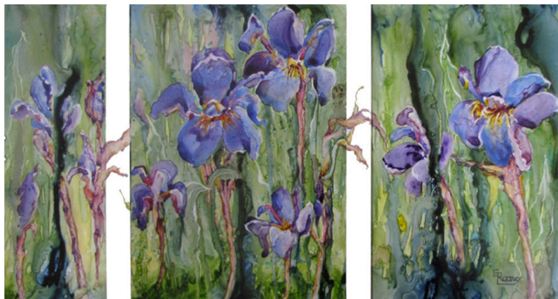
"Bayou" water media Chica Brunsvold Second Place