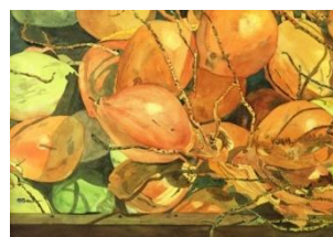
Cartful of Coconuts