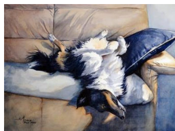
Covid Turned my World Upside Down