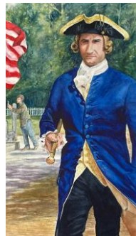
Celebrating Virginia History