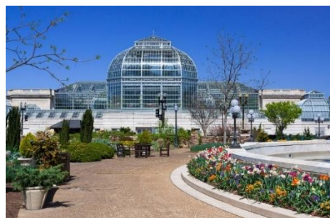
U. S. Botanic Gardens Conservatory