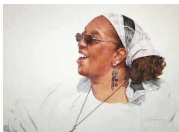
Nancy Jane Thomas BWS Award