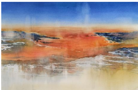
Grand Prismatic Spring