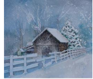
The Broken Fence