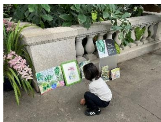
😊 Future members of PVW