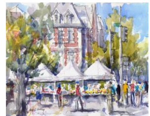
Dupont Circle farmers market