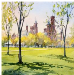
Smithsonian Castle in Spring