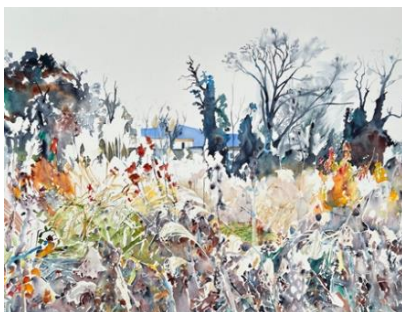
Wild Meadow Leigh Culver, 2 nd Place