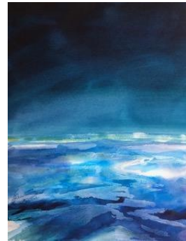
Ocean Light Kat Jamieson