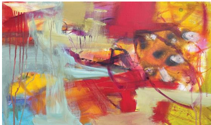
Snap, Crackle, Pop