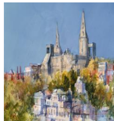
Georgetown University from Key Bridge