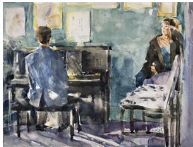
Don't Stop the Music