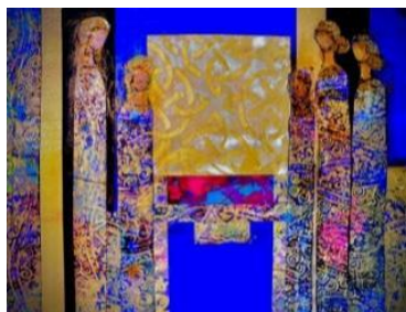
Celtic Saints & Symbols Elise Ritter