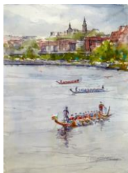
Dragon boat race Georgetown