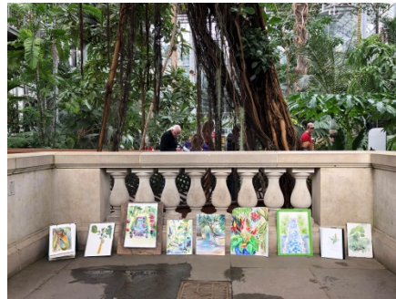
Results of our painting!